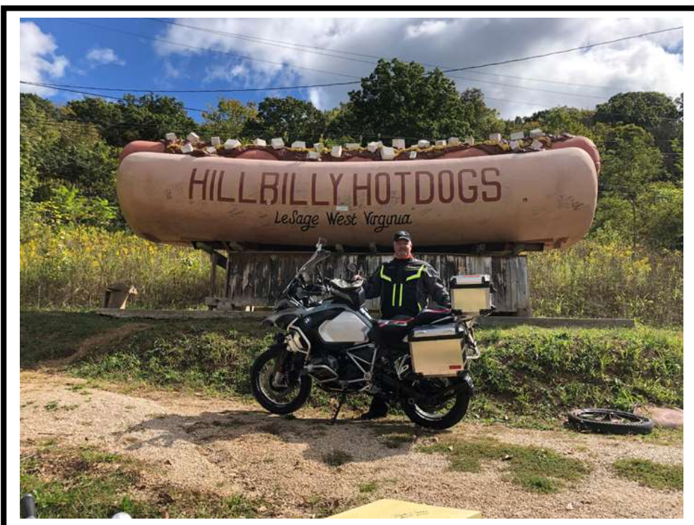
Hungry for a Hot Dog!

I've heard of Hillbilly Hotdogs for years and wanted to visit one day. Well, another event that we had on the calendar was cancelled due to a COVID spike in Wisconsin. I had already asked for the day off, so where do I go? Hillbilly Hotdogs! That should be a nice ride this time of the year!